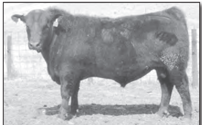
Ma & Pa Emblazon T359 - Sire of 031