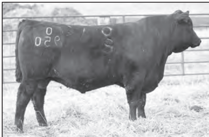
Ma & Pa Emulation H950 - Sire of 221

• 2 Pathfinder Dams in the pedigree. Powerful Tank son- gaining nearly 5lbs/day- Got to love his big-middled mama- Calving interval of 9/368 and one of the first cows to calve again this spring.