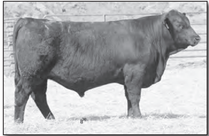
Ma & Pa Revelation H650 - Sire of 039

• 1 Pathfinder Dam in the pedigree. Pedigree reads like a heifer bull and all the numbers point there too. Gentle disposition and a great gainer! Safe for heifers!